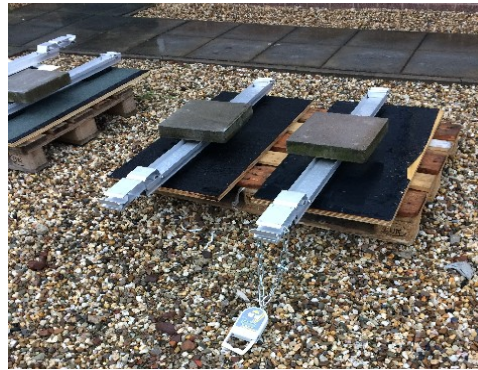
Measurement of friction coefficient

Conformity: CUR Recommendation 103: 2005 NEN 7250: 2014 NEN-EN 1990: 2011 NEN-EN 1991-1-4: 2011